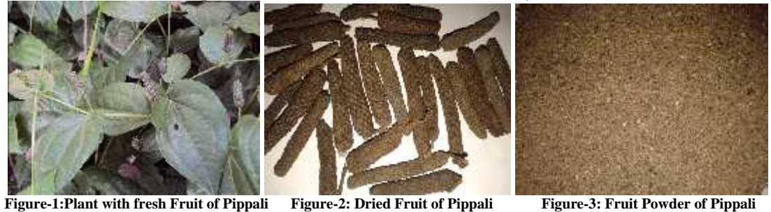
Figure-1:Plant with fresh Fruit of Pippali Figure-2: Dried Fruit of Pippali Powder Microscopy of Fruit Powder of Pippali

mechanical grinder to a moderate fine powder to carry out powder microscopic studies and had stored in a well closed airtight vessel for further analysis and crude powder of pippali had taken for hydroalcolalic extraction.